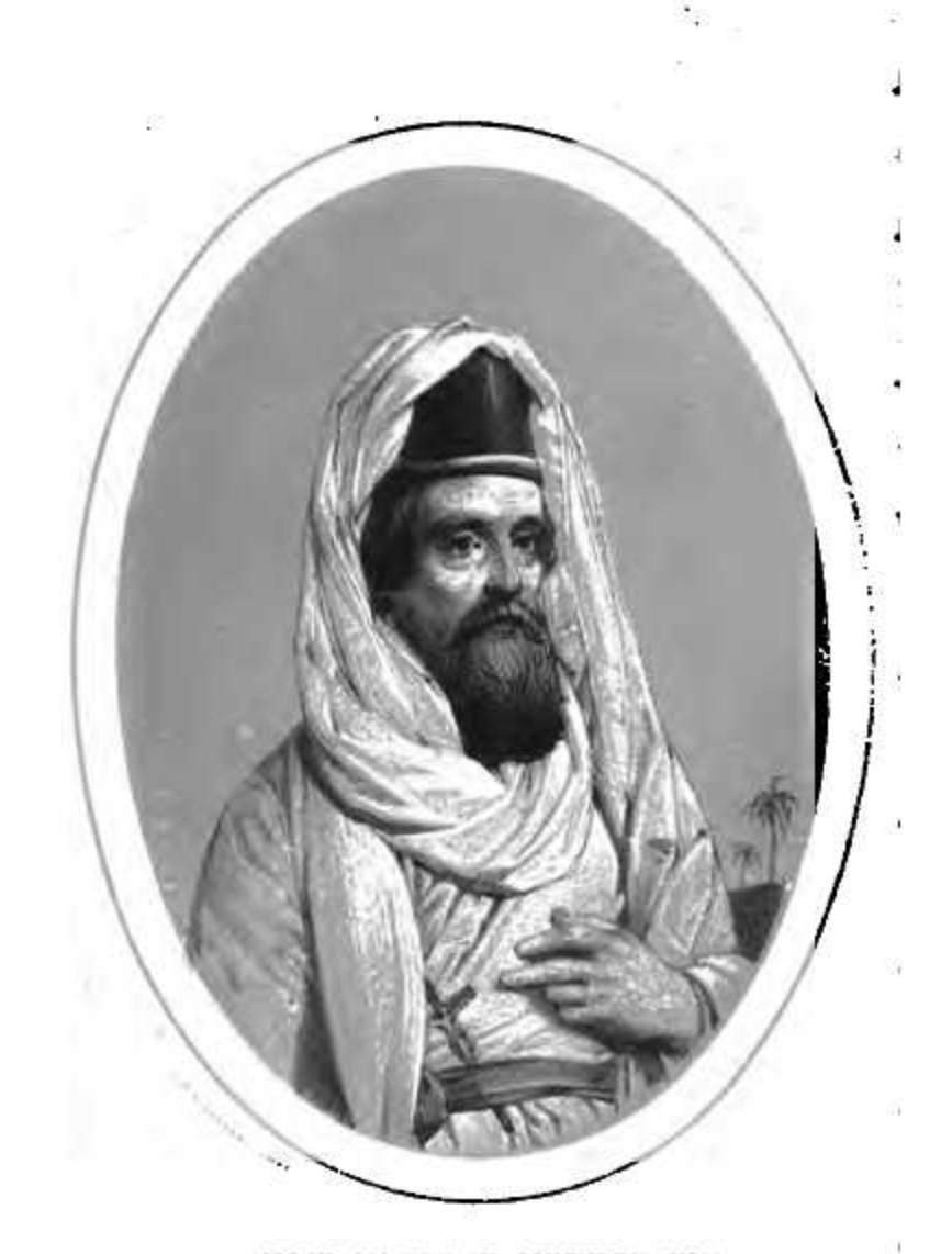
JESUT COSTUME, IN SOUTHERN INDIA.