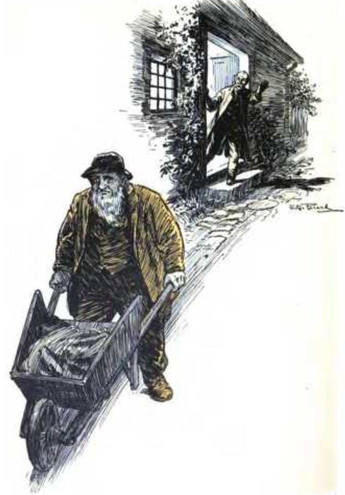
"Come back, an I'll lend ye the three pound." (Page 74.)