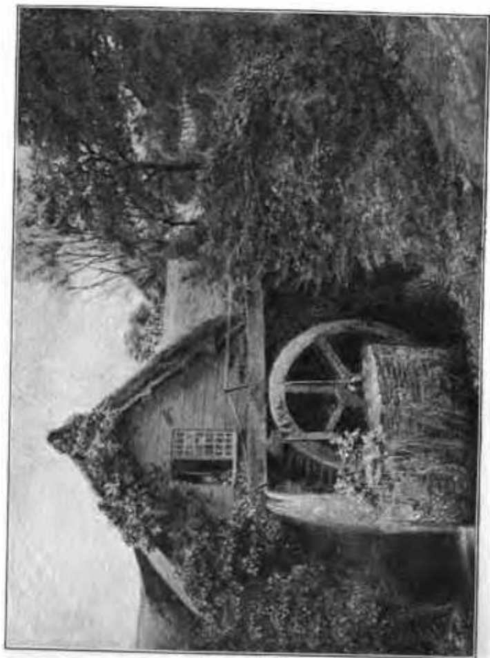
AN EXMOOR MILL.