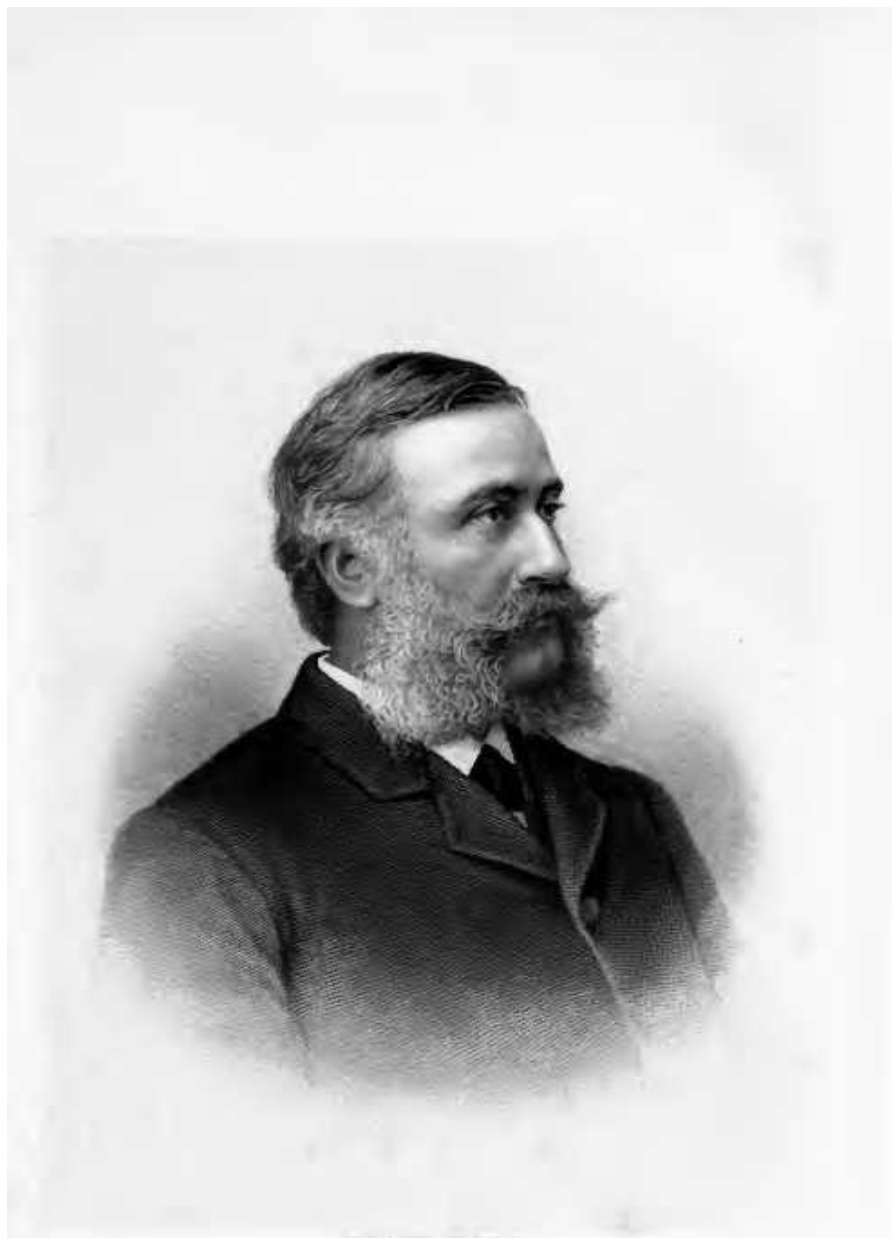
Hubert H. Bancroft