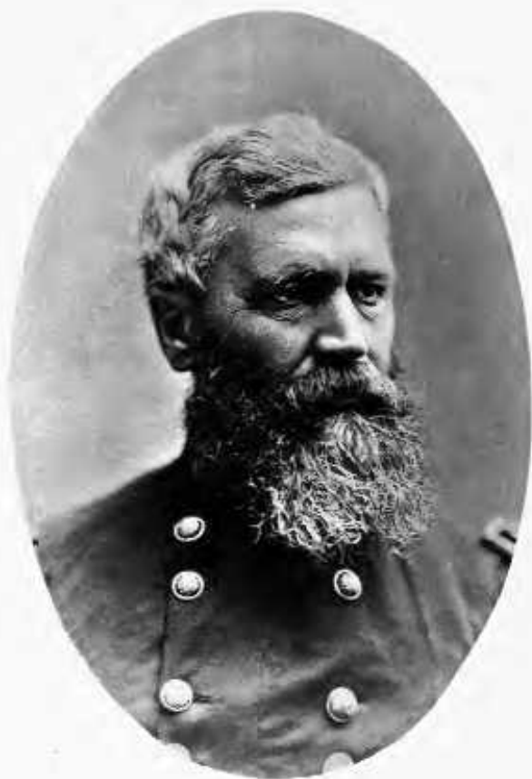
O. O. Howard Brig. Gen. U.S.A.