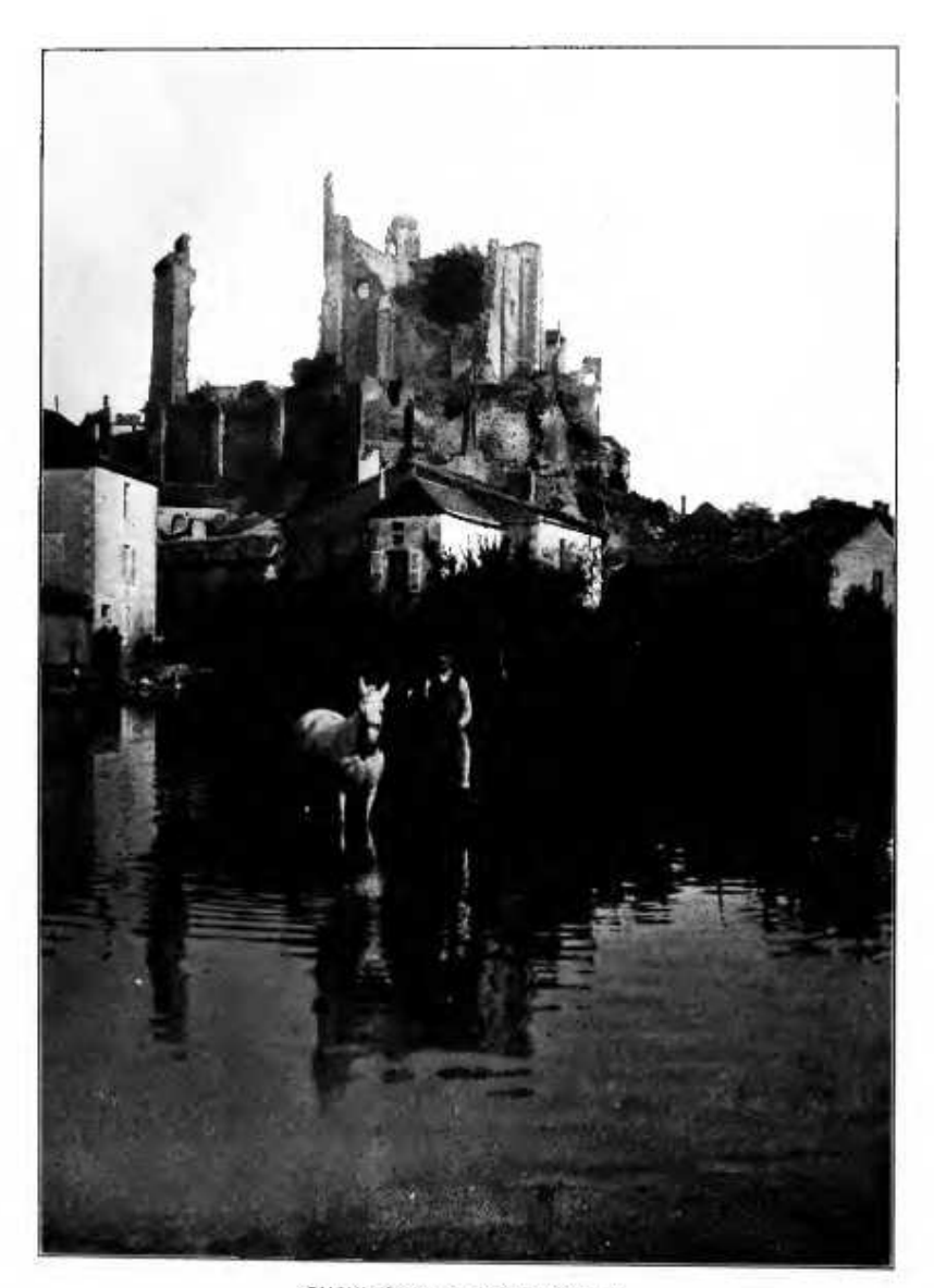
CHAUVIGNY: RUINS OF CASTLE