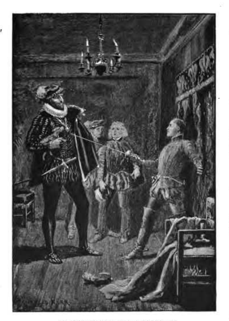
"He did not stir, and I could not do it."—See p. 7L.