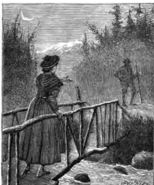
OVER THE STREAM.