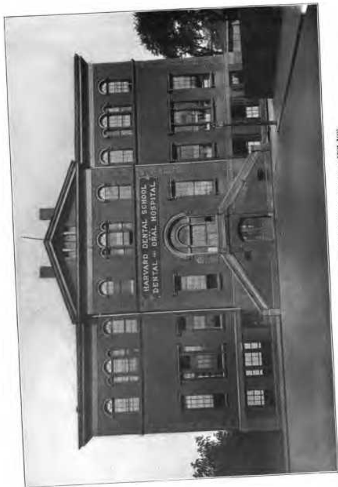
LECTURE ROOMS, LABORATORIES AND INFIRMARY 1883-1885. NORTH GROVE ST., BOSTON, MASS.