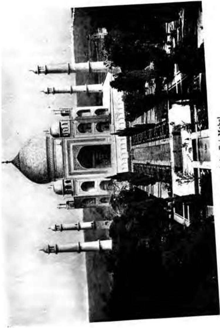
Picture of the Taj Mahal