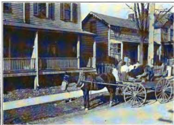
COTTAGE PLACE. SEMI-DETACHED HOUSES AND COTTAGES. THE MEN ARE PEDDLING OIL-CLOTH.

This street nearly parallels the railroad track on the north as one approaches the main station when coming from New York. On one side of the street is the railroad embankment, on the other a straggling line of dingy-looking, cheaply