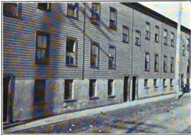
COTTAGE PLACE. ROW OF HOUSES, NOT BEAUTIFUL, BUT PLENTY OF LIGHT AND AIR IN THE APARTMENTS.

A row is three or more houses built together, with common walls between adjoining houses.