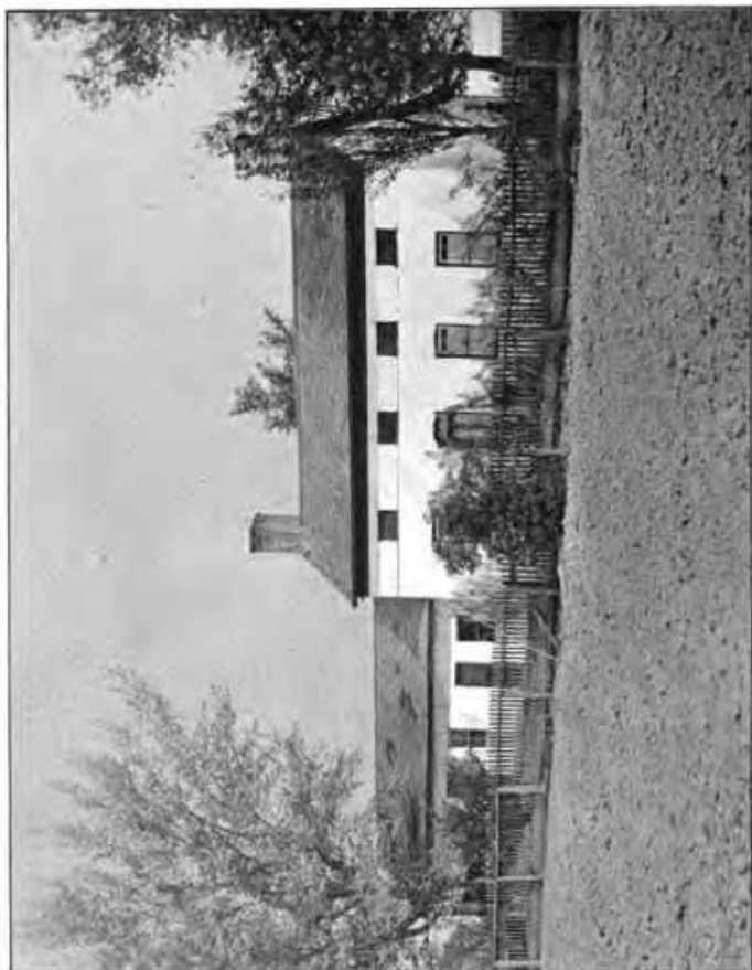
THE DECAMP HOMESTEAD, ERECTED 1828, On site of Log-house of 1822. (Photographed April 23, 1896.)