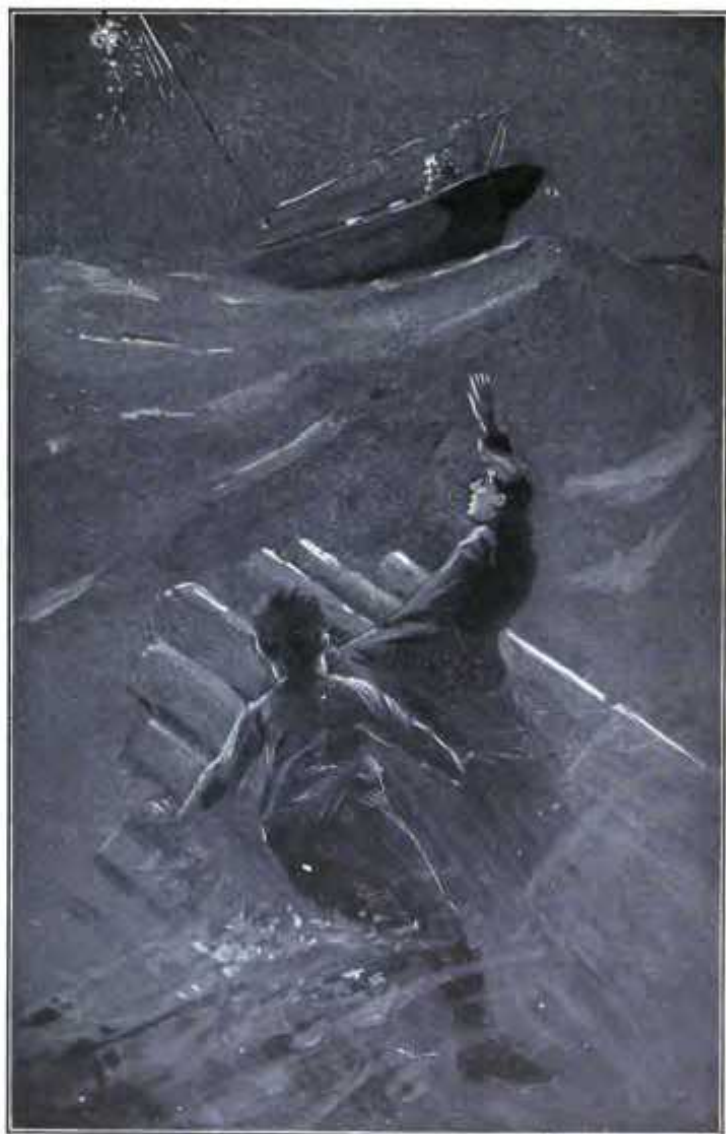
THE BLAZE REVEALED A LARGE MASS OF LUMBER RISING AND FALLING ON THE TURBULENT WATERS.— Frontispiece The Rover Boys on the Great Lakes.