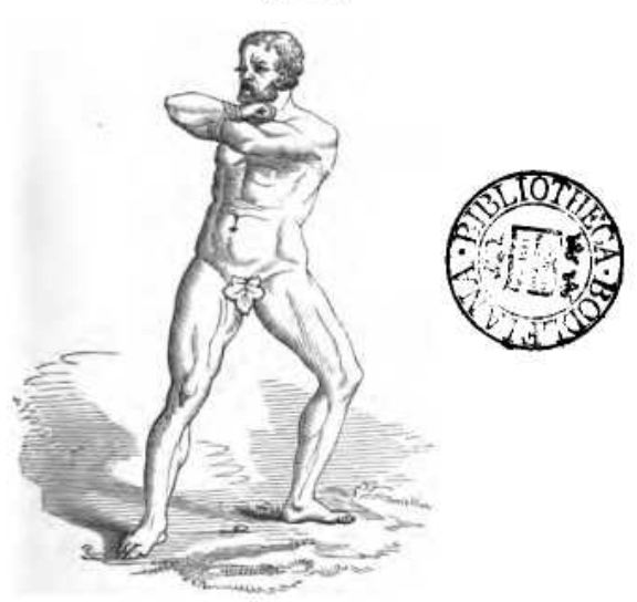
SAMSON BURSTING HIS BONDS

ILLUSTRATED WITH UPWARDS OF 70 ENGRAVINGS