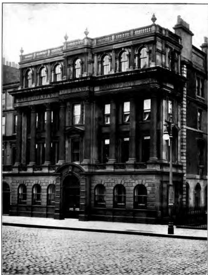
CALEDONIAN HEAD OFFICE—REBUILT 1878. GROUND FLOOR AND ELEVATION ALTERED 1904.