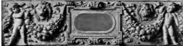
TERRA COTTA FRIEZE OF MAIN BUILDING.