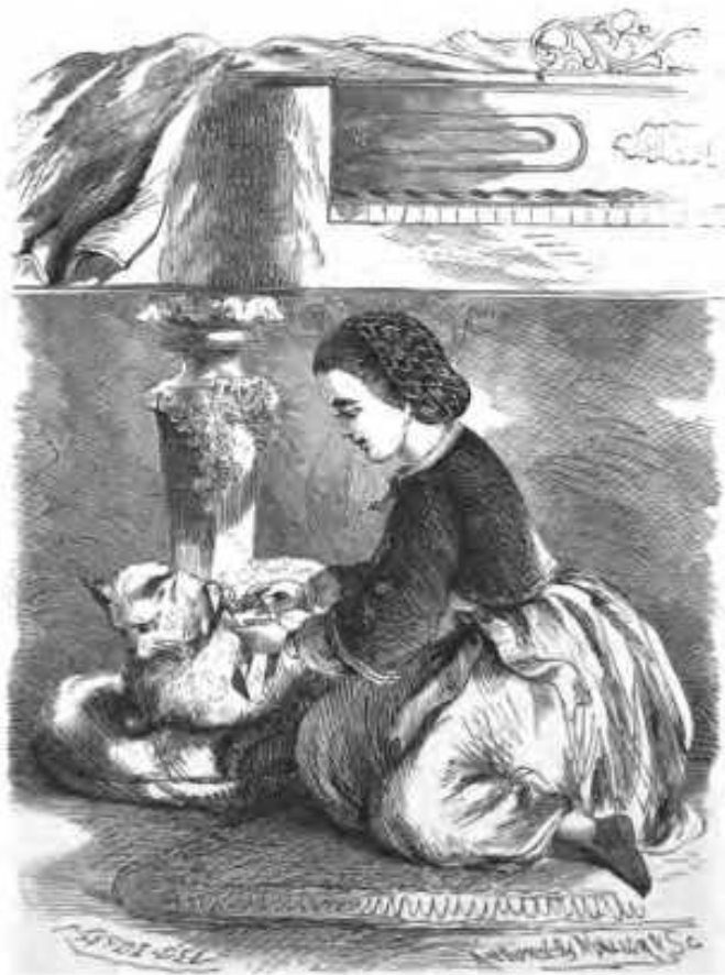
MINNIE PLAYING WITH FIDELLE. Page 10.