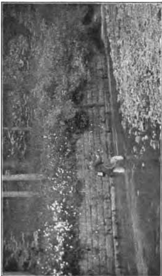
CLEAR WATER WORMING.