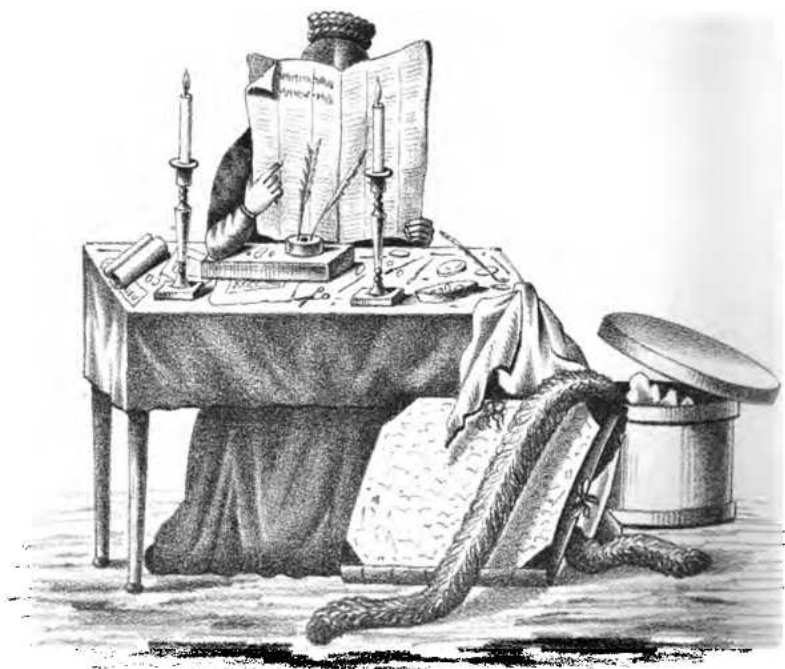
This be London's Visitor.