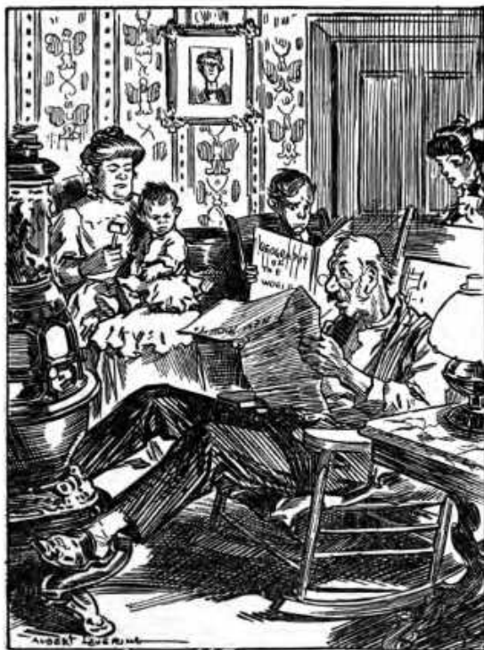
"While thus crisping himself he loved to read News Notes from Gotham"