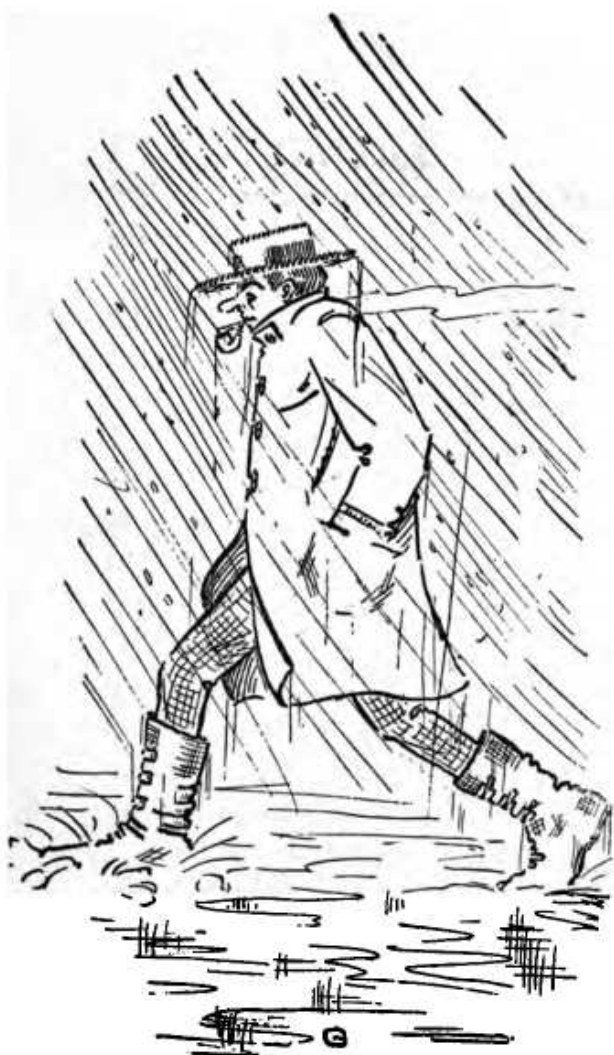
Early preparation — a walk in the Arctics