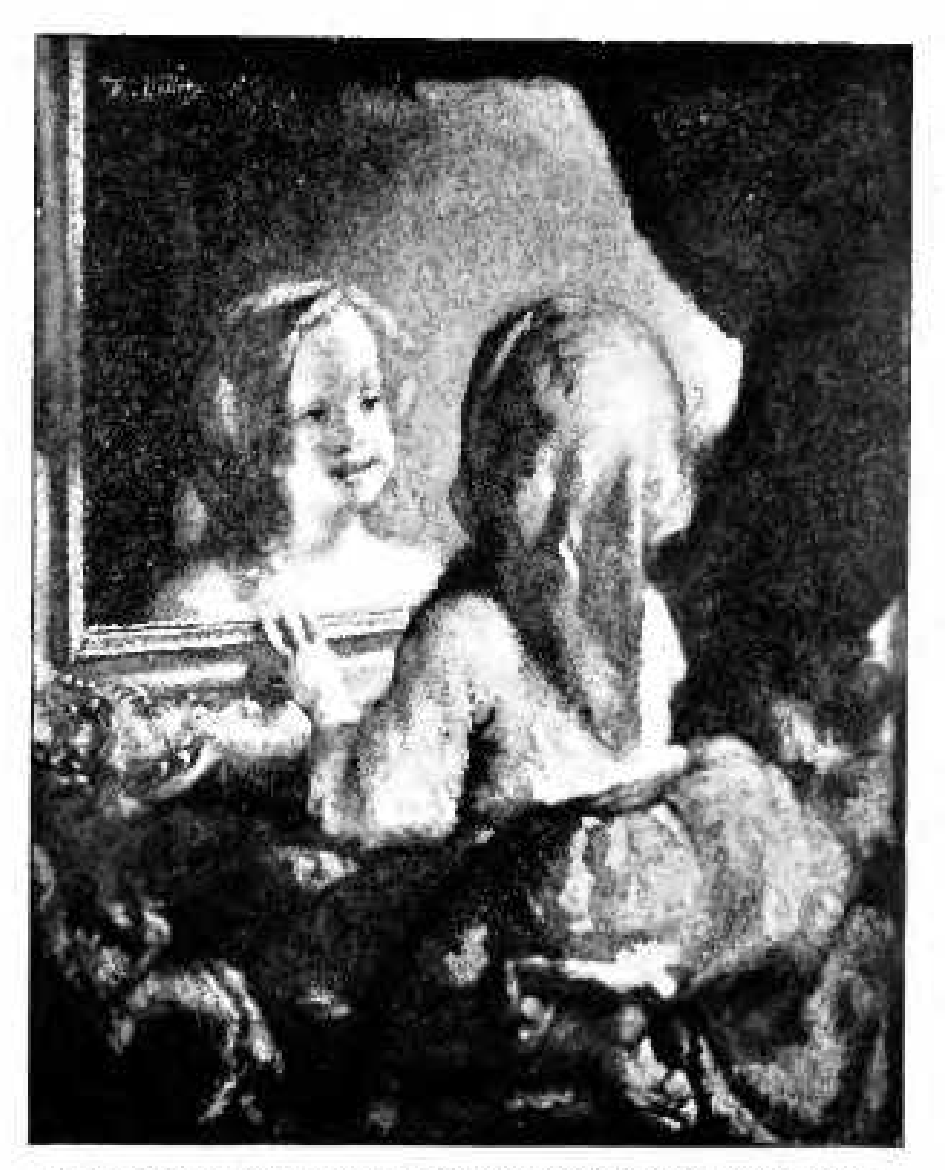
PORTRAIT OF LITTLE ANTOINETTE FEUARDENT