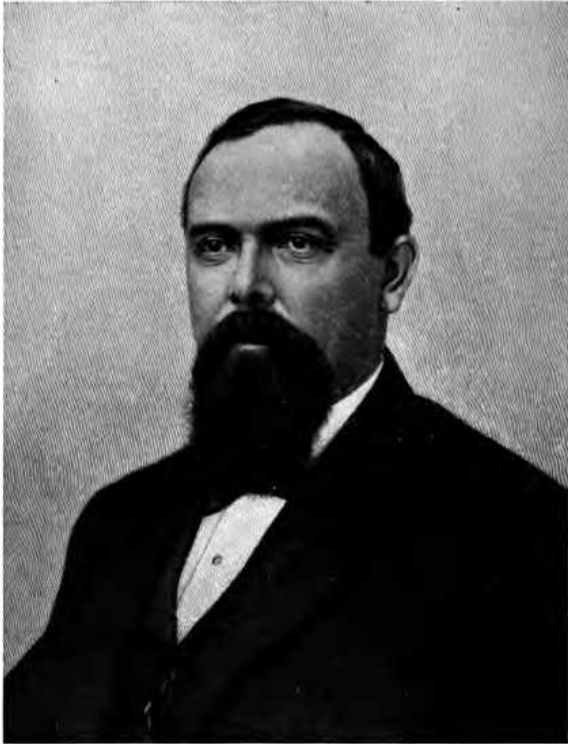
OLIVER P. MORTON