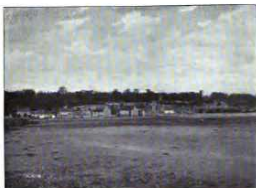
Culross from the Old Pier