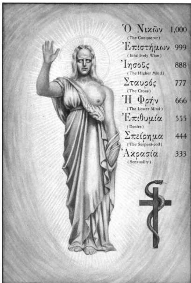
Ἡ Κλεῖς τῆς Γνώσεως (The Key of the Sacred Science)