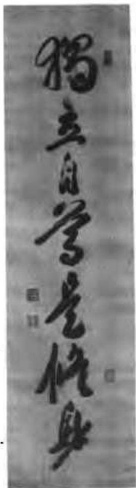
Fac-simile of Scrolls written by Mr. Fukuzawa.