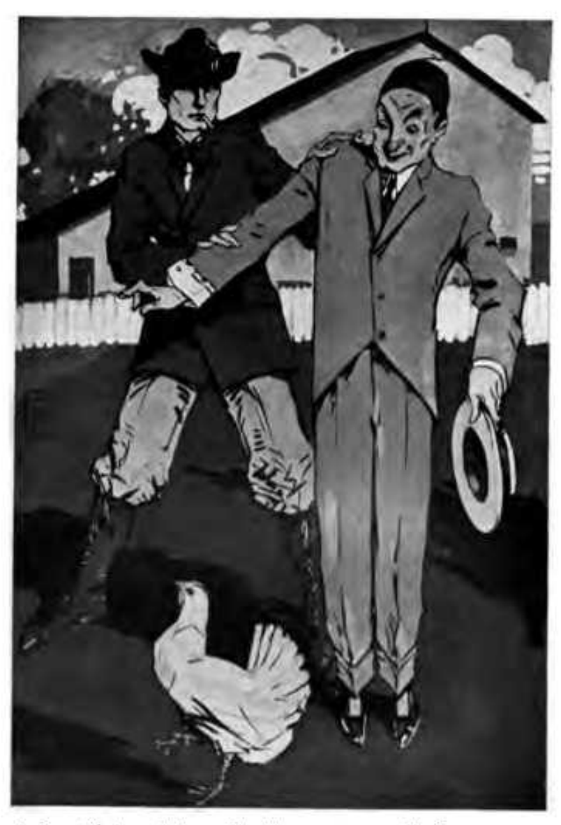
A beautiful and inexplicable creature walked across our path