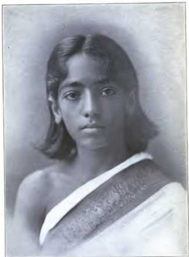
J. Krishnamurti Alcyone