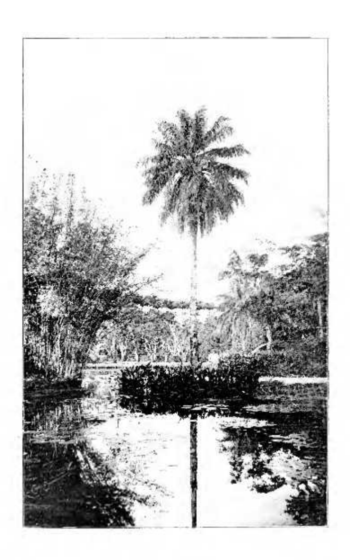
UNDER THE PALM.