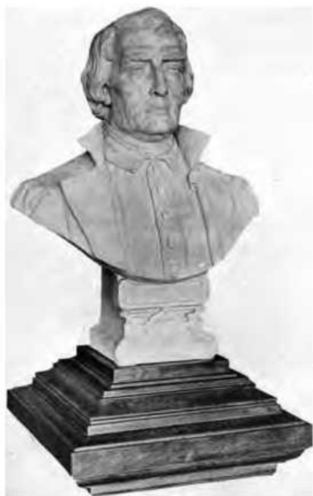
BUST OF OLAVUS PETRI. MODELED BY JEAN LE VEAU.