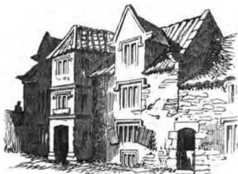
Manor-house, Fyke, Seventeenth century.