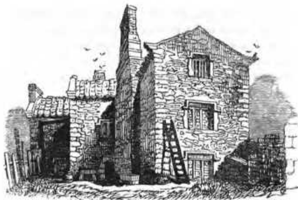
Manor-house, Byker—West end.