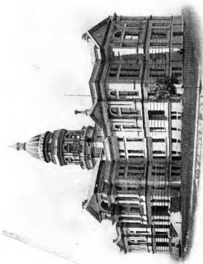
STATE CAPITOL AT CHEYENNE.