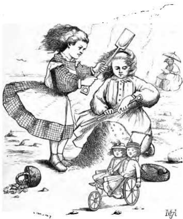
'They made sand castles and pits, and sand puddings with stones in them for plums.'—PAGE 4.