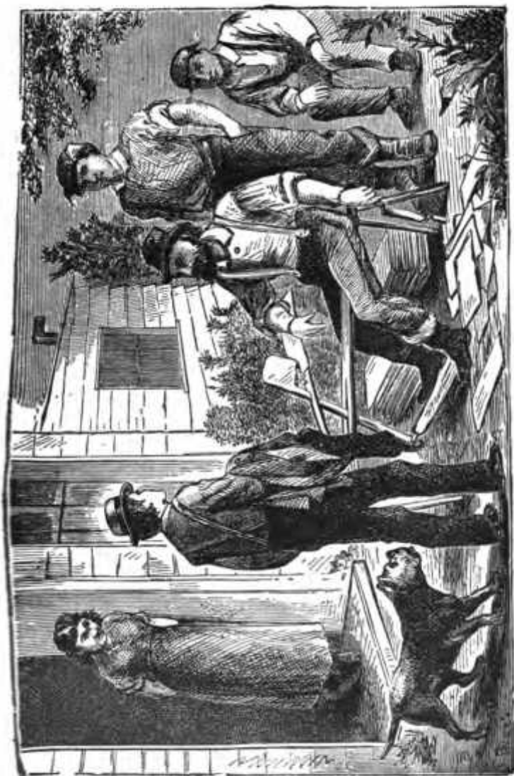
FIRST ACQUAINTANCE WITH FLAT CREEK.