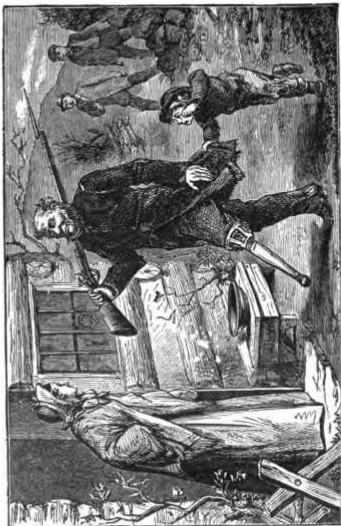
STANDING GUARD OVER HIMSELF. See page 128.