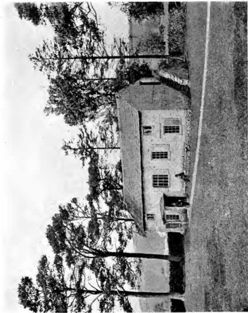
"Amid Westmoreland's sacred solitudes"