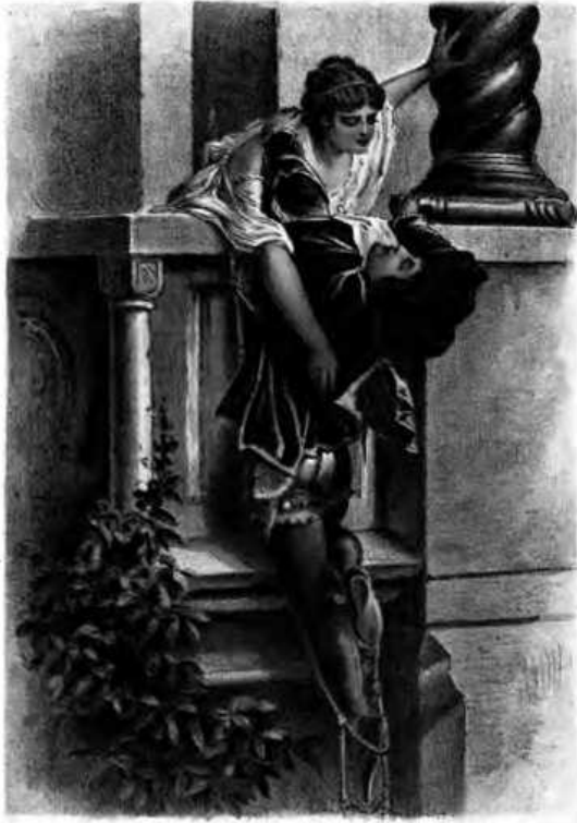
ROMEO: "Farewell, farewell! 'one kiss, and I'll descend."—Page 180