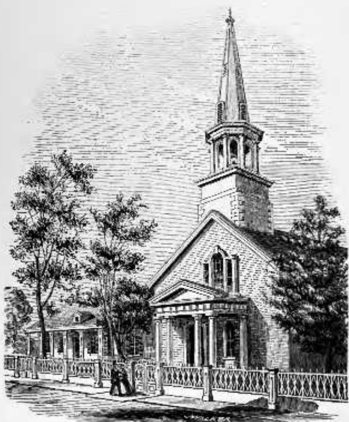
PARISH CHURCH AND RECTORY, ST. JOHNS, C. E.