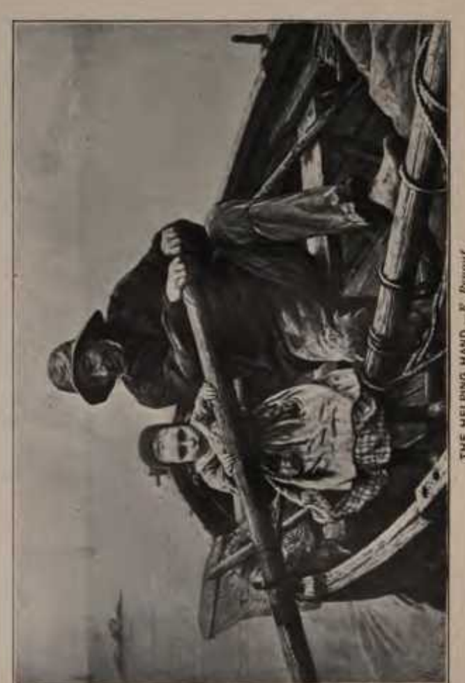
THE HELPING HAND.