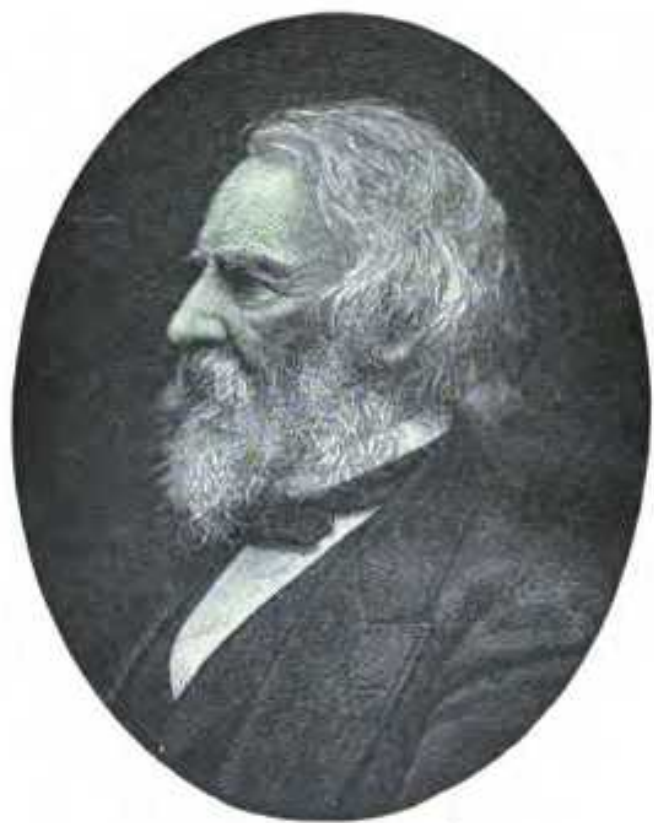
Henry W. Longfellow