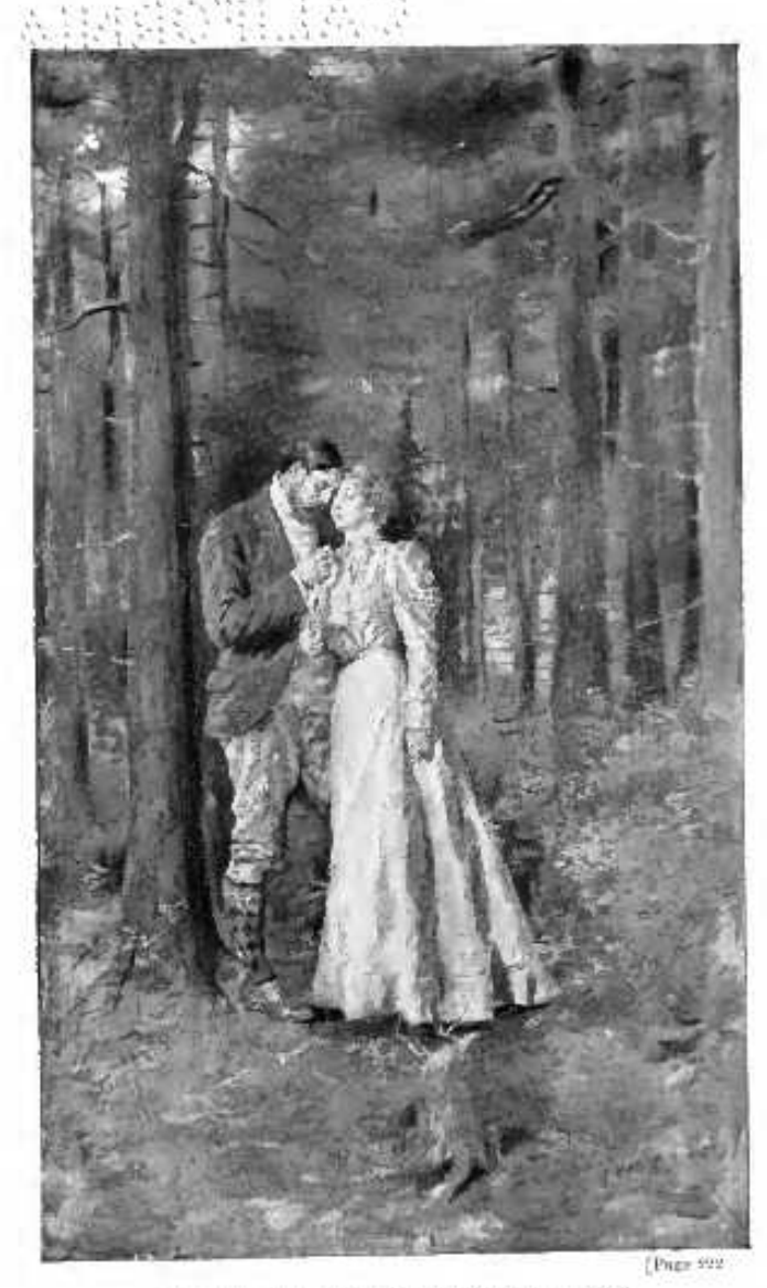
" THAT WAS THE MOMENT OF LIFE"