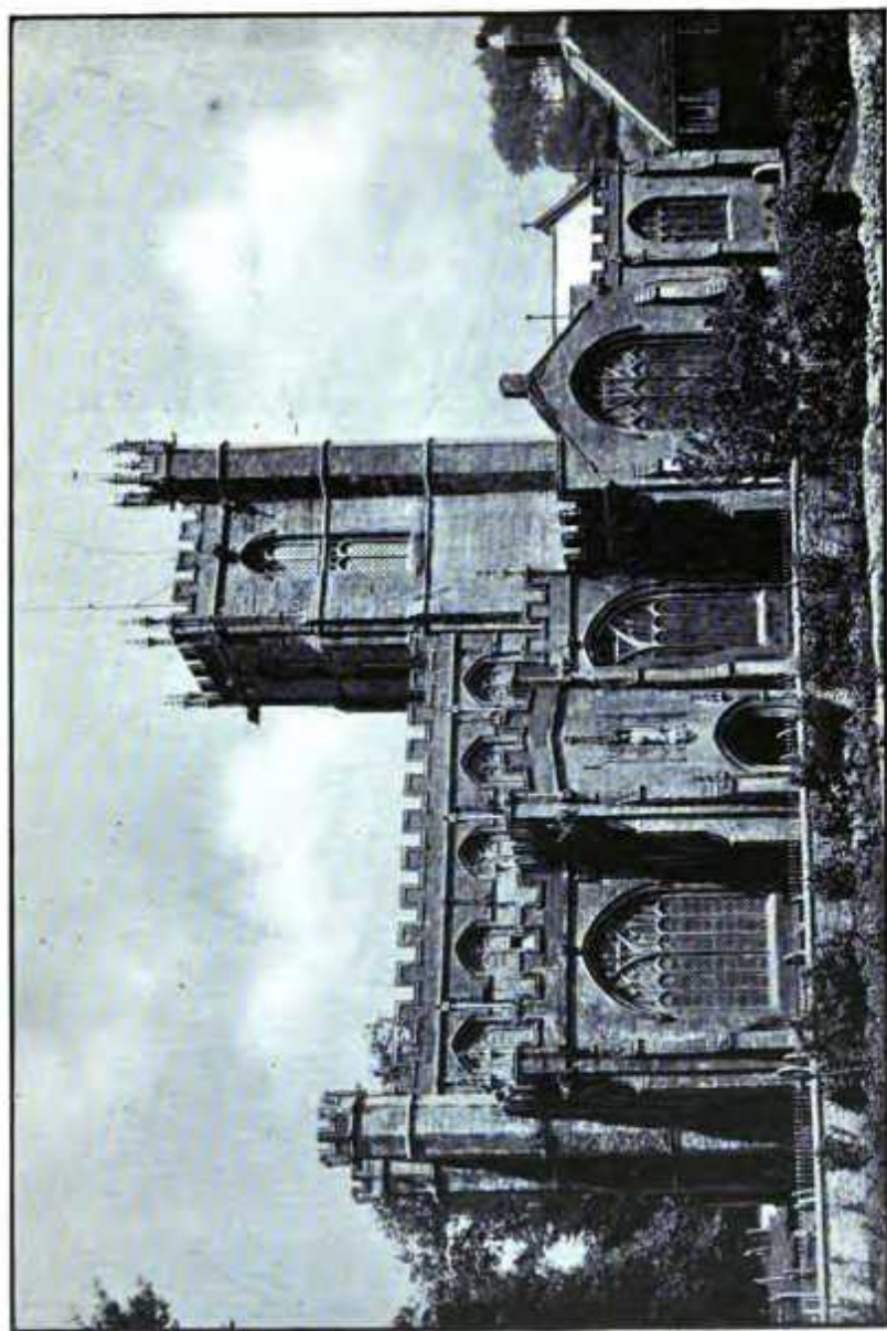
CREWKERNE PARISH CHURCH. SOUTH VIEW.