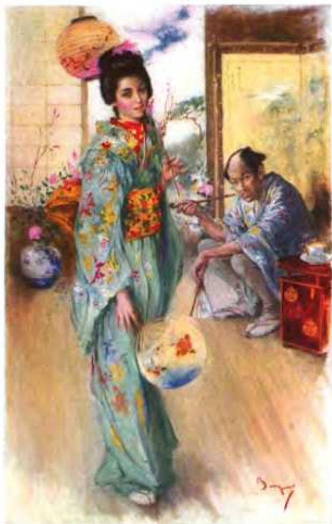
Beautiful even in her pallor