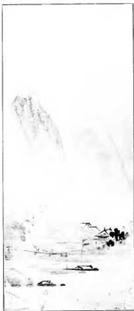
A RAINY LANDSCAPE From a Kakemono by SANSETSU (British Museum)