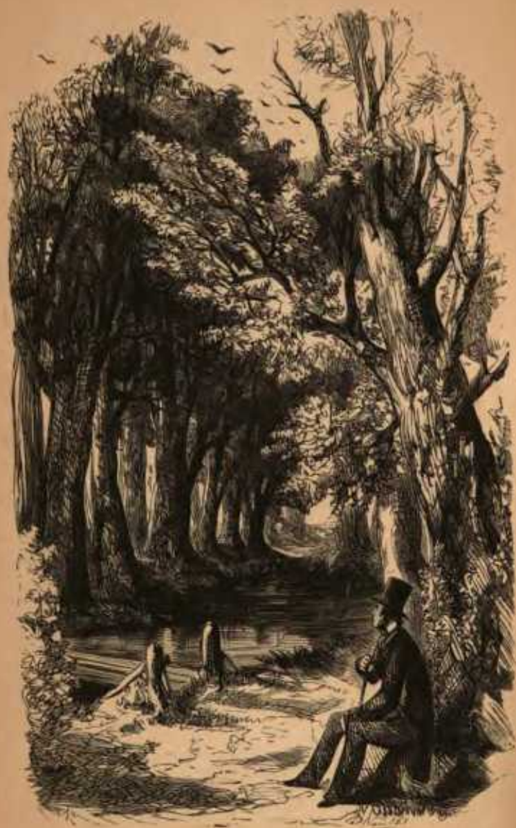
THE BUCKEY.—p. 3.