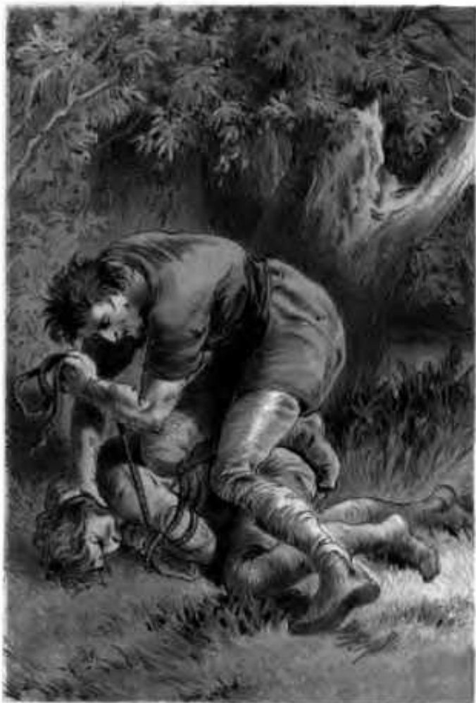
GIANT INTEMPERANCE AND HIS PRISONER