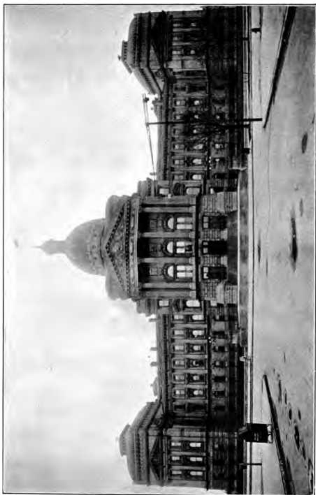
Indiana State Capitol Building, Indianapolis, Erected 1878.