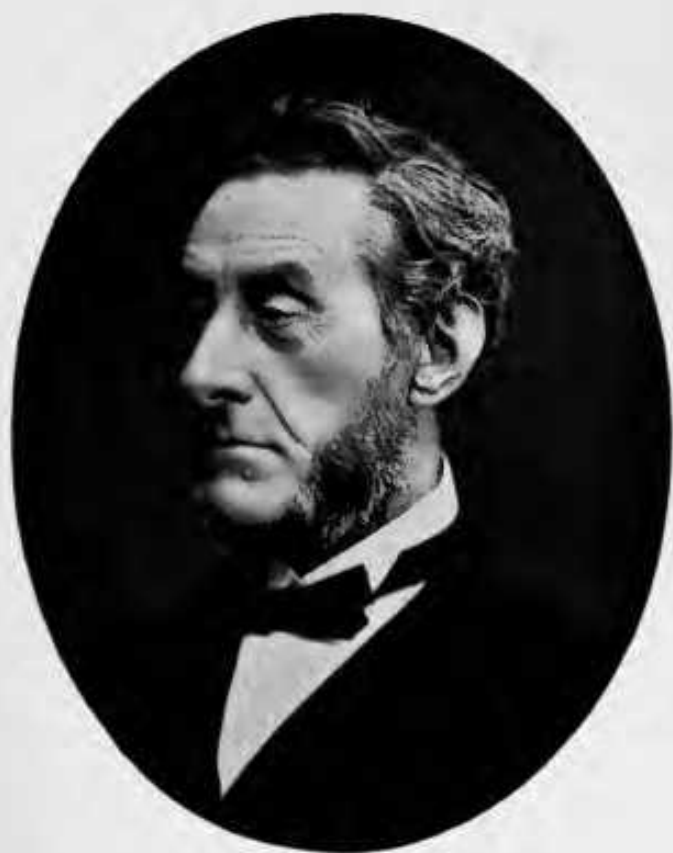
THE EARL OF SHAFTESBURY.