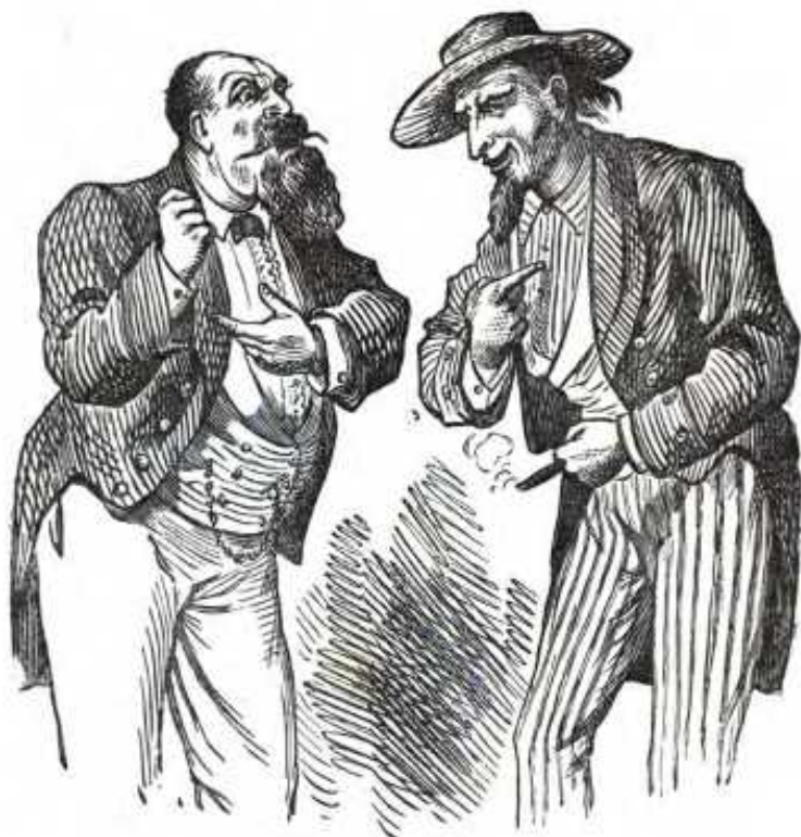
A CONVERSATION UNDER DIFFICULTIES.

"Never go to France unless you know the lingo, For if you do, like me, why you'll repent, by jingo." TOM HOOD.