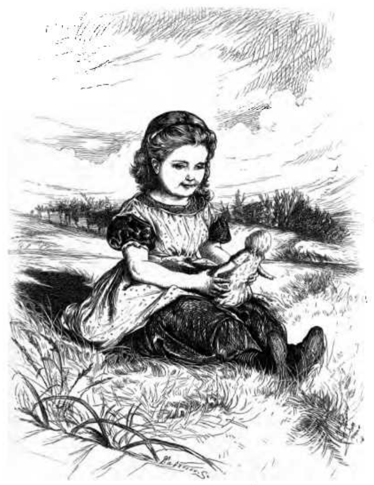
THE FIELD BECAME MV NURSERY."