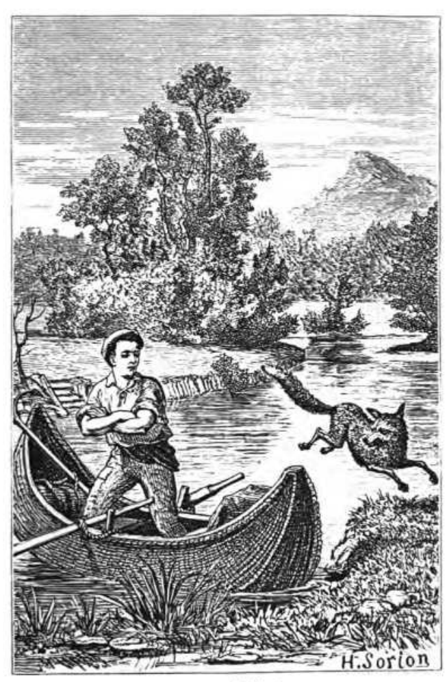
ACHERIA, THE FOX.-P. 43.